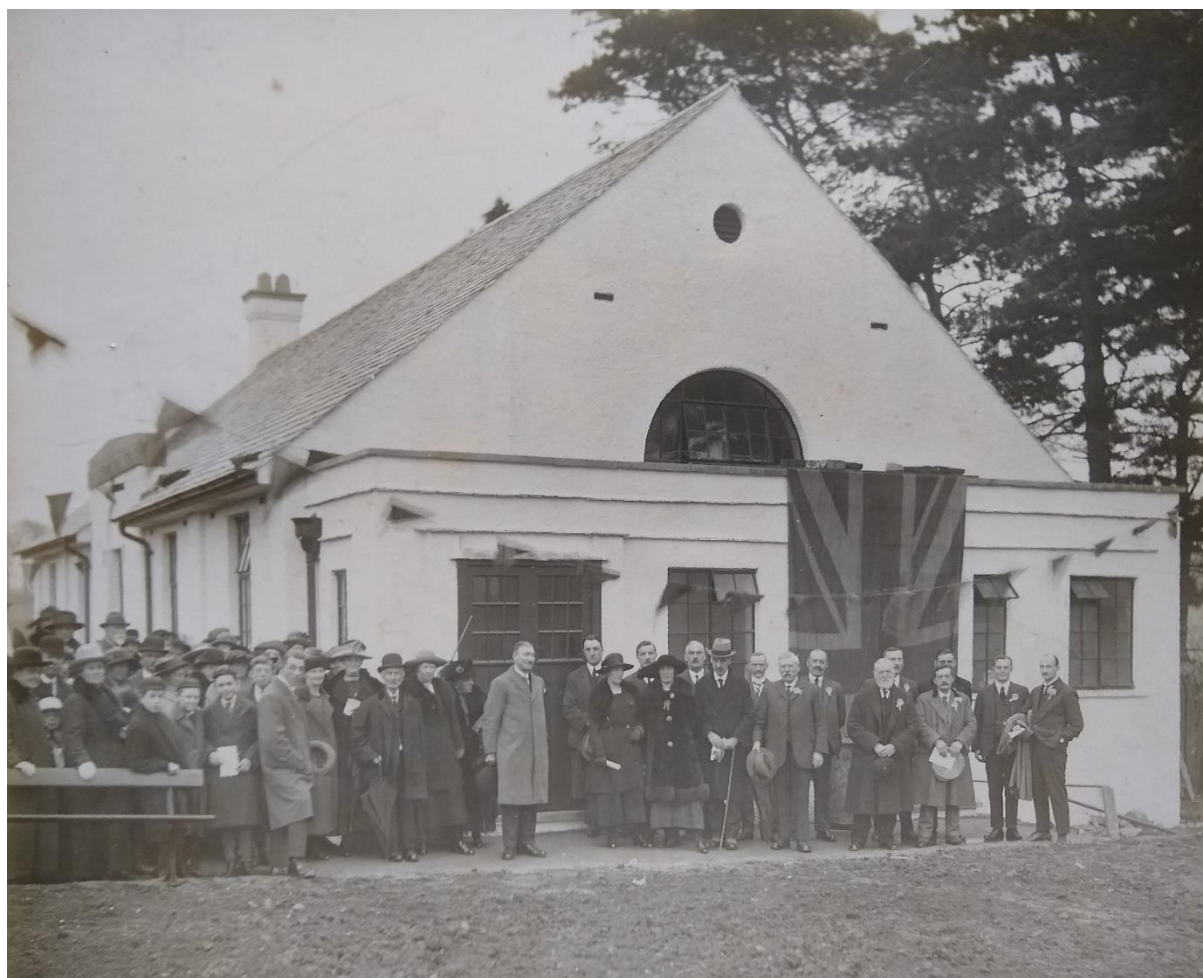
The opening of the Memorial Hall in 1922.